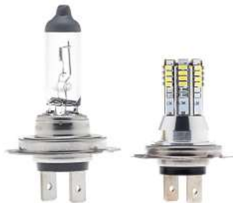
Std H7 Bulb an H7 LED