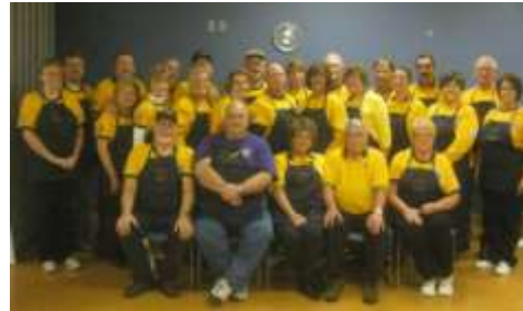
Chapter B Annual Chili Cookoff always held in January each year, for over 25 yrs big fund raiser for St Jude