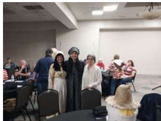
Submitted by Stanley Rinehart