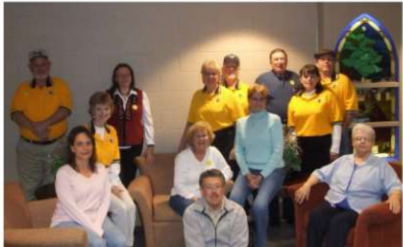
Chapter G2 Spaghetti Dinner 1-12-2008