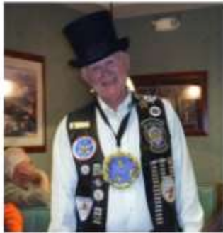
Dave Ding-A-Ling Award 2007