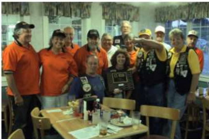
Plaque Chasing Chapter C , 8-14-2007