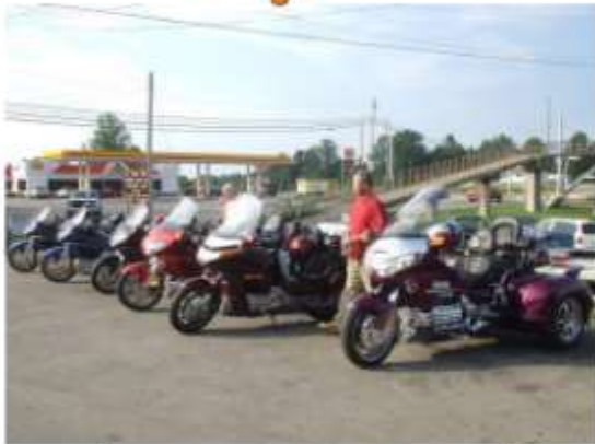
Kentucky Rally 8-25-2007