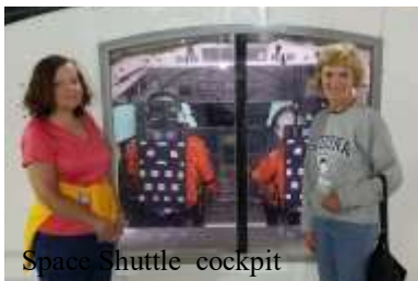
Space Shuttle cockpit

Our trip to the Air Force museum was just a little interesting. It rained and then rained some more. We all got checked into our hotel