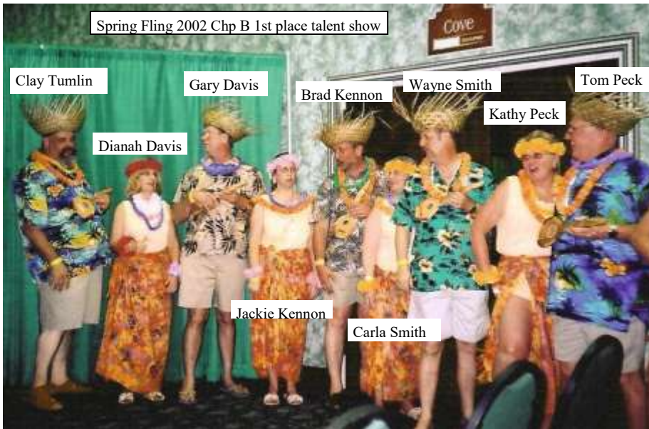
Spring Fling 2002 Chp B 1st place talent show

Each year our couples of the year have some expenses as they travel around representing our Chapter and our Association. Several years ago some came up with a great idea to help out our District couples with some of the expenses they have. Suggestions were for each Chapter to put together a basket of Goodies that would be put on display and raffle tickets would be sold during our annual Spring Fling convention. We will be asking our membership to once again put their thinking caps on and come up with some sort of idea for Chapter B's Basket. Something to do with the Convention Theme " Lets Go Hawaiian " we can discuss what items we need and see if our members would like to contribute to the basket or just make a donation so our committee can go out and buy a few things for the basket. Below are a few baskets from other conventions so you can see some examples.